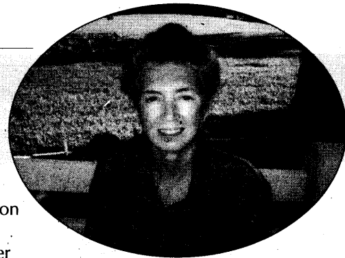
Mary Lou Williams

Williams and other storytellers have a cornucopia of categories from which to choose: traditional stories, recounted orally from generation to